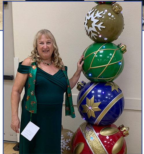
Orange County Ceilidh